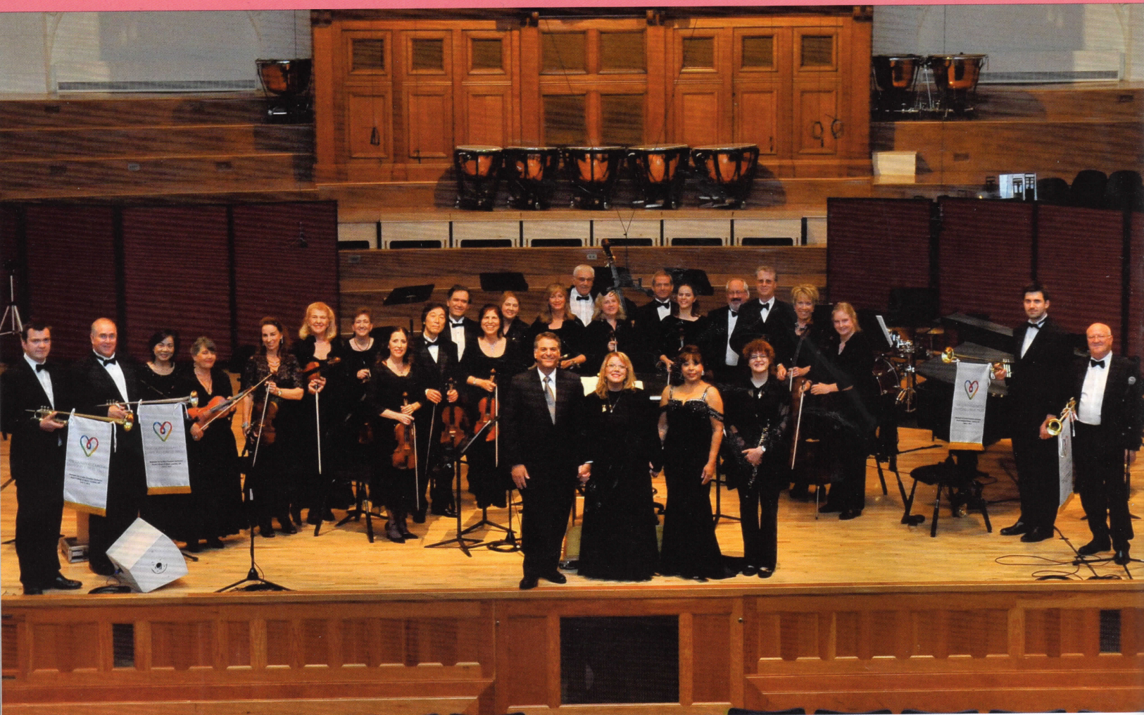
Musique Sur La Mer performs at the Royal College of Music in London