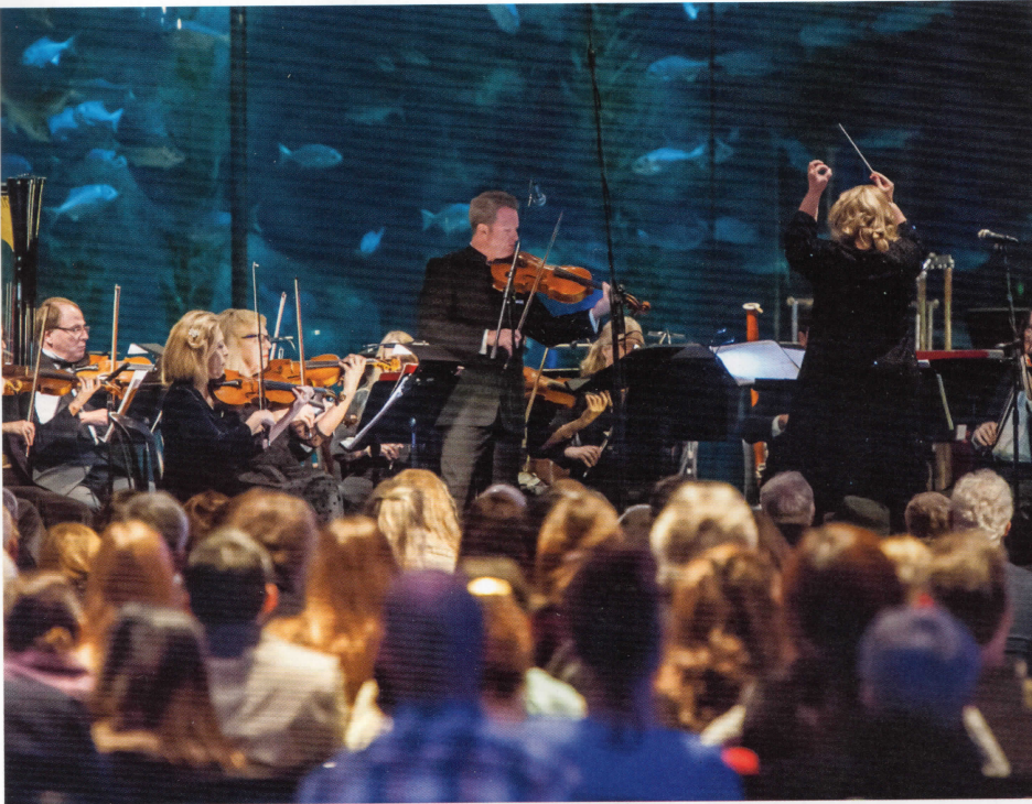
Musique Sur La Mer performs at the Aquarium of the Pacific

MSLMO performs music styles from Baroque and classical to pop, jazz, non-Western, and new compositions while hosting master classes, concerts, and coaching sessions, all with community and charity in mind. Its music education programs are of the highest quality, uplifting, empowering, and inspiring young musicians. Studios are located in Shoreline Village.