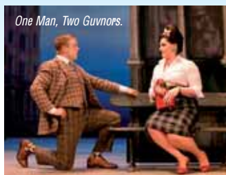
One Man, Two Guvnors.

Highly acclaimed National Theatre transfer of Richard Bean's English version of Goldoni's classic Italian comedy – sex, food and money are high on the agenda.