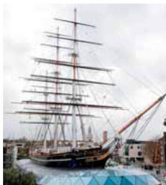
Cutty Sark at Greenwich.

The Royal Albert Hall will be transformed into an ice rink this weekend, when the international ice dance sensation, The Imperial Ice Stars, return with their spectacular award-winning masterpiece Swan Lake on Ice. Tickets from the box office, telephone 020 7589 8212.