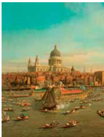
Canaletto London The Thames on Lord Mayor's Day