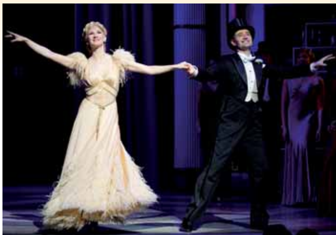
Summer Strallen and Tom Chambers in Top Hat Curtain Call.