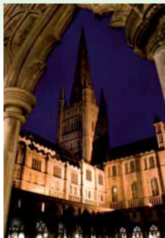
Norwich Cathedral by night.