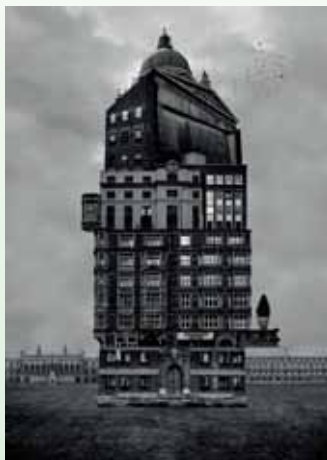
Beomsik Won, Archisculpture 008 , 2012, gelatin silver print, 180 x 120cm, edition 10.

Place Not Found is a group exhibition showing a big variety of work including sculpture, paintings, photography and installations.